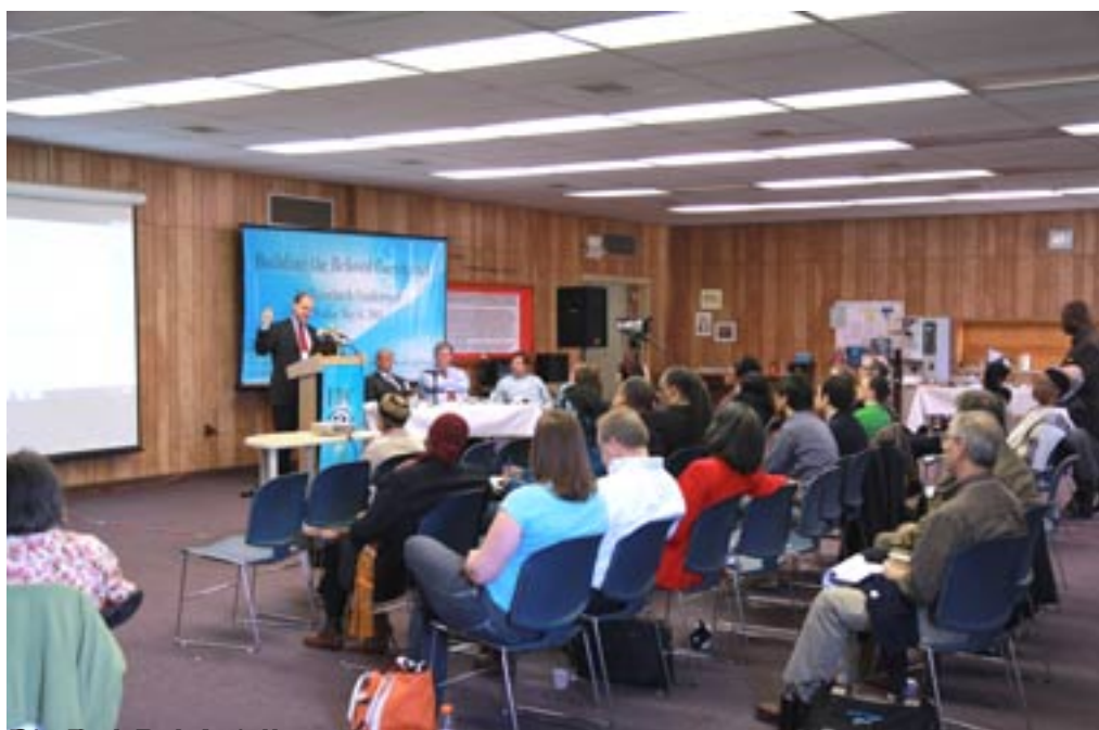
Building the Beloved Community: An Initiative for Regional and Community